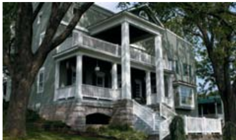
By the Side of the Road B&B