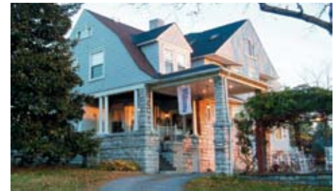
The Stonewall Jackson Inn

The Harrisonburg Bed & Breakfast experience combines unique amenities with the warm hospitality that Harrisonburg is becoming famous for.