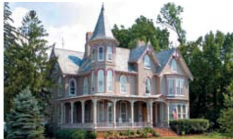
Joshua Wilton House