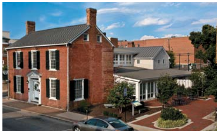
From Interstate 81 take exit 247A or 245 into historic downtown Harrisonburg

Self-guided commemorative downtown walking tour booklet $2.00