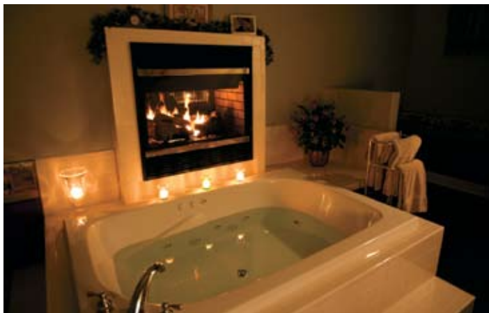
Fireplaces and Featherbeds at By the Side of the Road

The Stonewall Jackson Inn is a very special Bed and Breakfast, known for their awarding winning service and comfort; it has become a favorite for small groups. The Inn is a restored mansion (circa 1885) that is unique to the Shenandoah Valley, a blend of traditional Queen Anne and New England Cottage Style architecture.